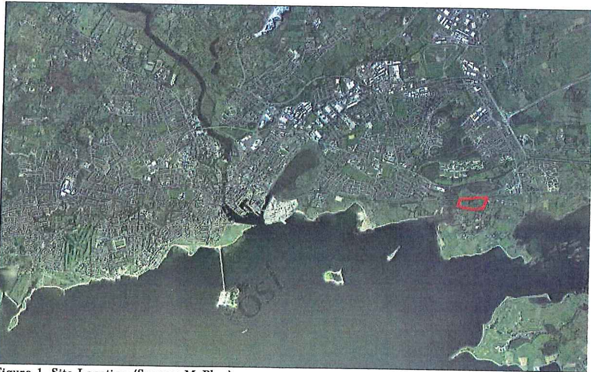
Figure 1- Site Location

On behalf our client, Kegata Ltd, we are requesting written certification that Rosshill Road has been taken in charge and / or declared a public road by Galway City Council. The section of the road which we are particularly interested in receiving confirmation on is the area outlined to the North and North West of the application site which incorporates the 'indicative route'.